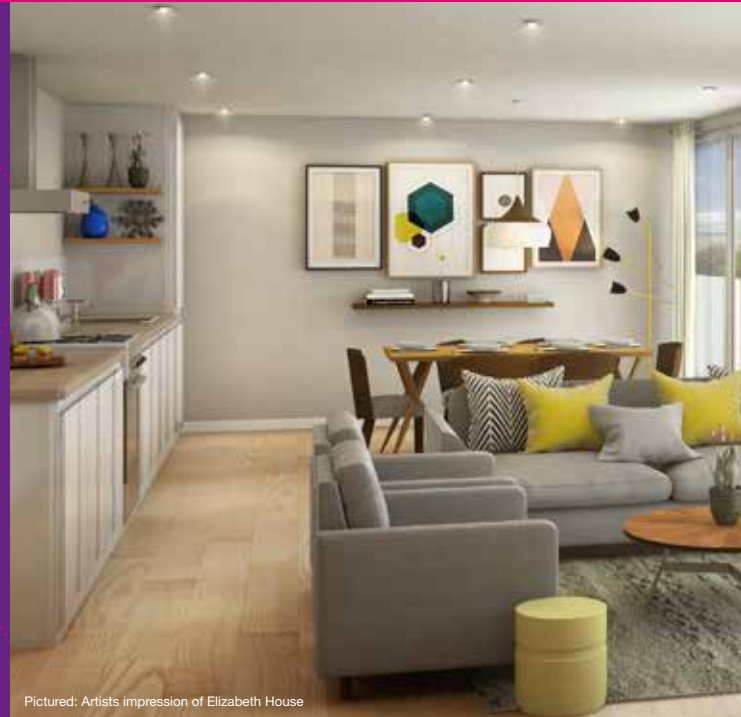
Pictured: Artists impression of Elizabeth House

1-26, 1 Christopher Road, East Grinstead RH19 3BT